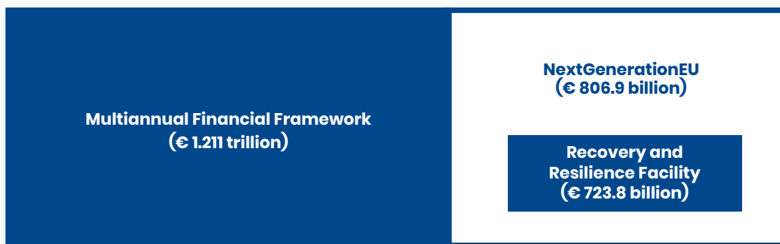
Figure 5: Overview of the Multiannual Financial Framework in relation to NextGenerationEU and the Recovery and Resilience Facility